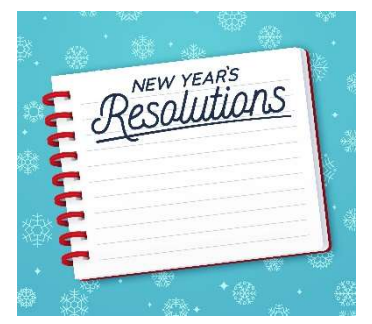
Content accurate as of 16 December 2022

Welcome to our monthly newswire. In this issue we cover the tax announcements in the Chancellor's Spring Statement. As usual, please contact us if you wish to discuss any matters further.